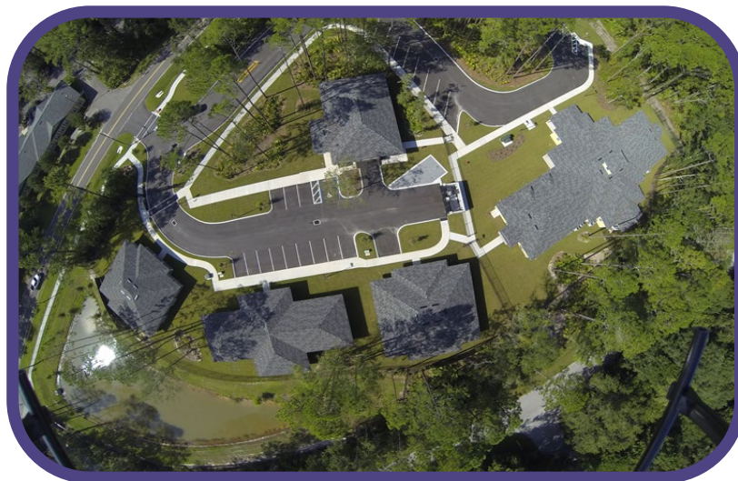
Peaceful Paths Campus

Peaceful Paths began its mission in the Gainesville area in 1974 as the Rape Information and Counseling Service (RICS), a grassroots organization that was formed to fight against sexual violence. In 1976, RICS began to expand its services to include battered women, and in 1977, established a spouse abuse hotline. In September of that year, the name of the organization was changed to the Sexual and Physical Abuse Resource Center to better reflect the changing mission. In January of 1978, SPARC was granted a lease on a shelter site and the shelter opened with its first client on March 30 of that year. In 1997, the agency acquired a transitional housing facility that expanded focus to include supportive housing for survivors. In October of 2000, SPARC underwent another name change to refocus the community on the mission of ending domestic violence. In October of 2015, Peaceful Paths opened the Dutton-Schilling Emergency Services Campus, a 72 bed housing community for shelter and supportive housing for survivors and their children. Peaceful Paths continually works to expand comprehensive services to adult and child victims and survivors of intimate partner violence.